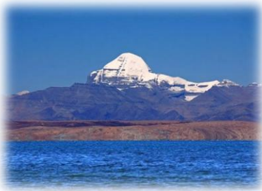
Manas Sarovar Lake arrival.

Day 5: - Proceed for Manas Sarovar Lake (4,500 m.) in the morning.